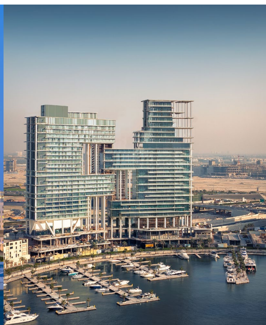
THE RESIDENCES, DORCHESTER COLLECTION, DUBAI