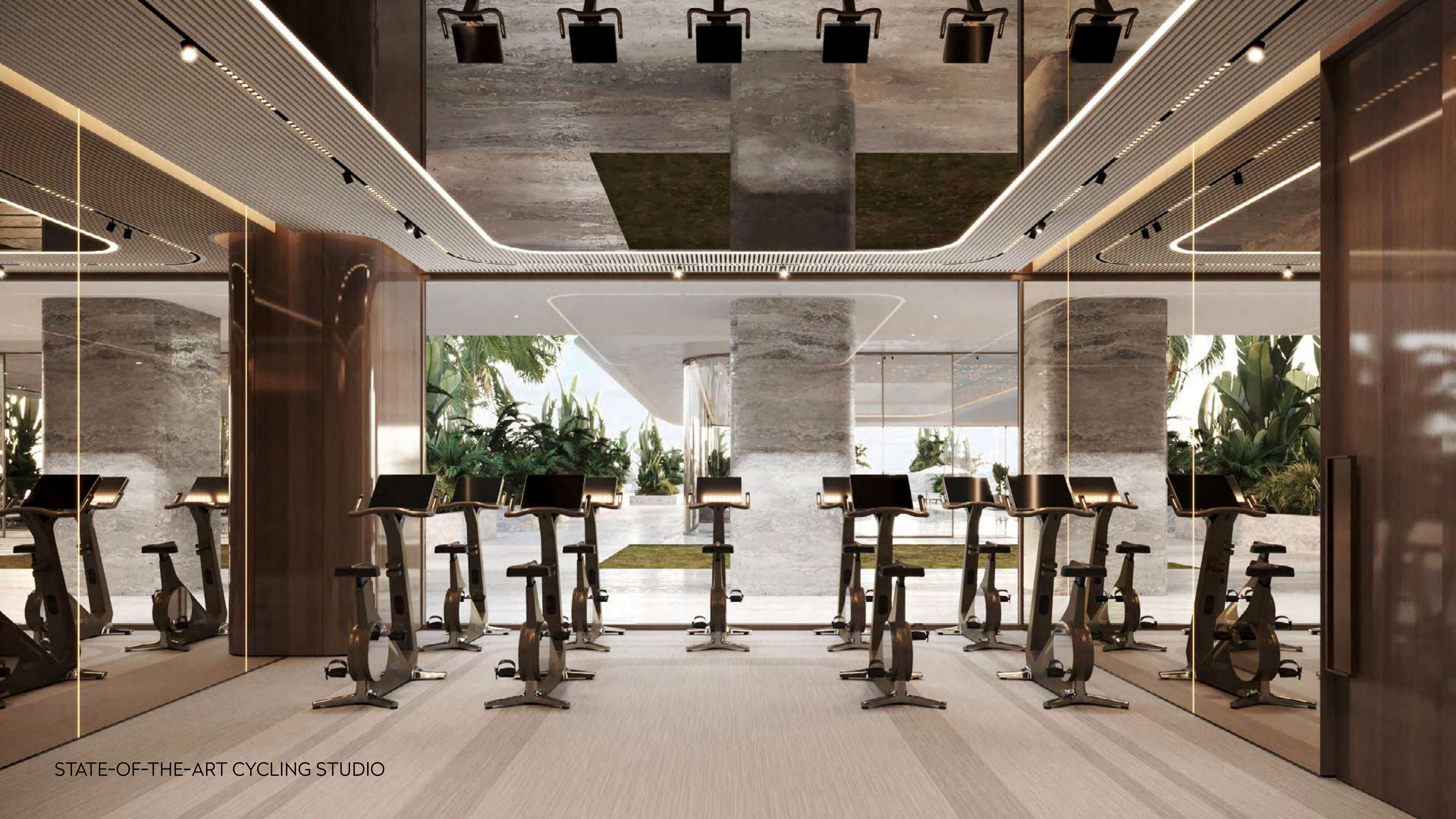
STATE-OF-THE-ART CYCLING STUDIO