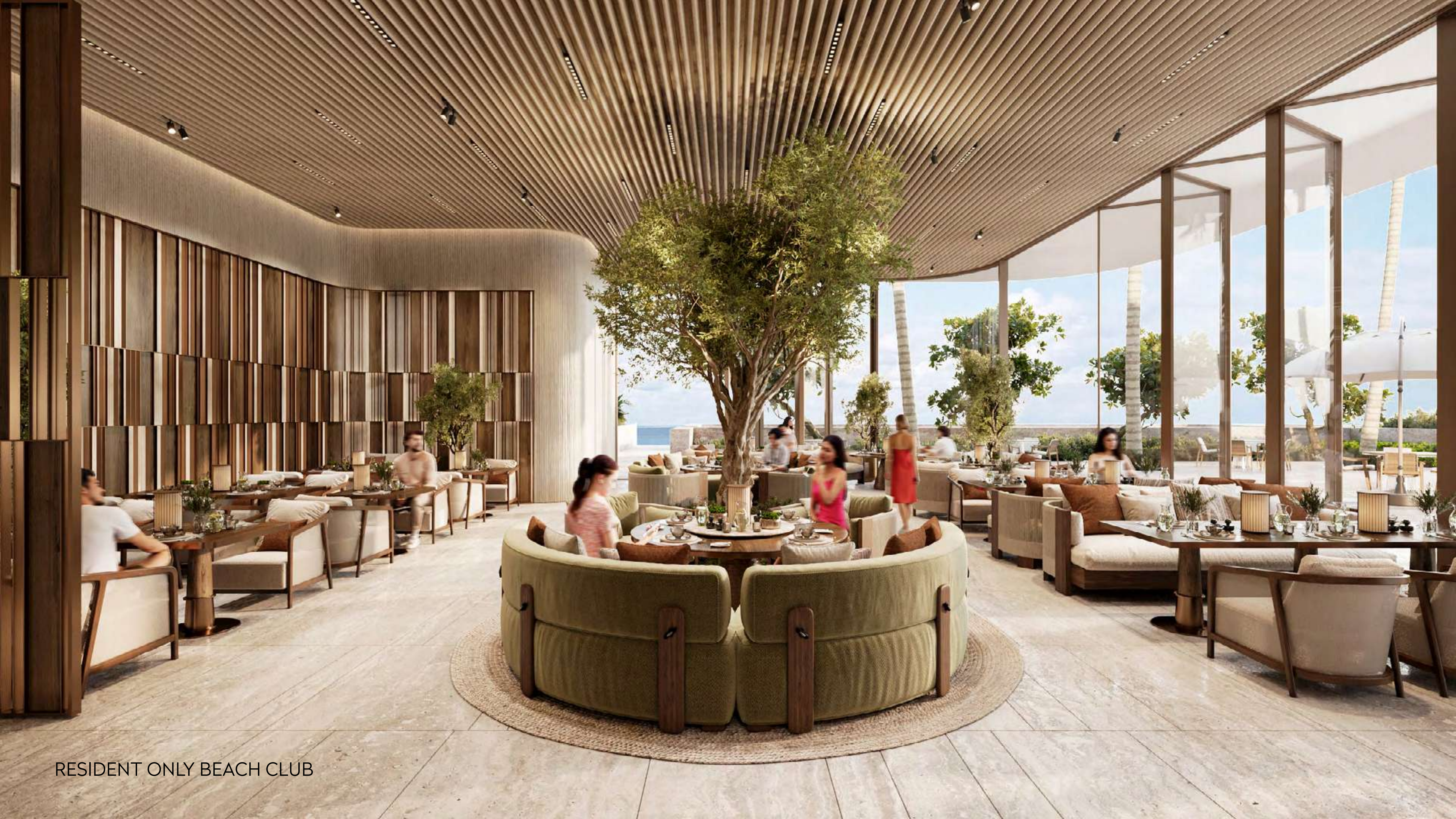
RESIDENT ONLY BEACH CLUB