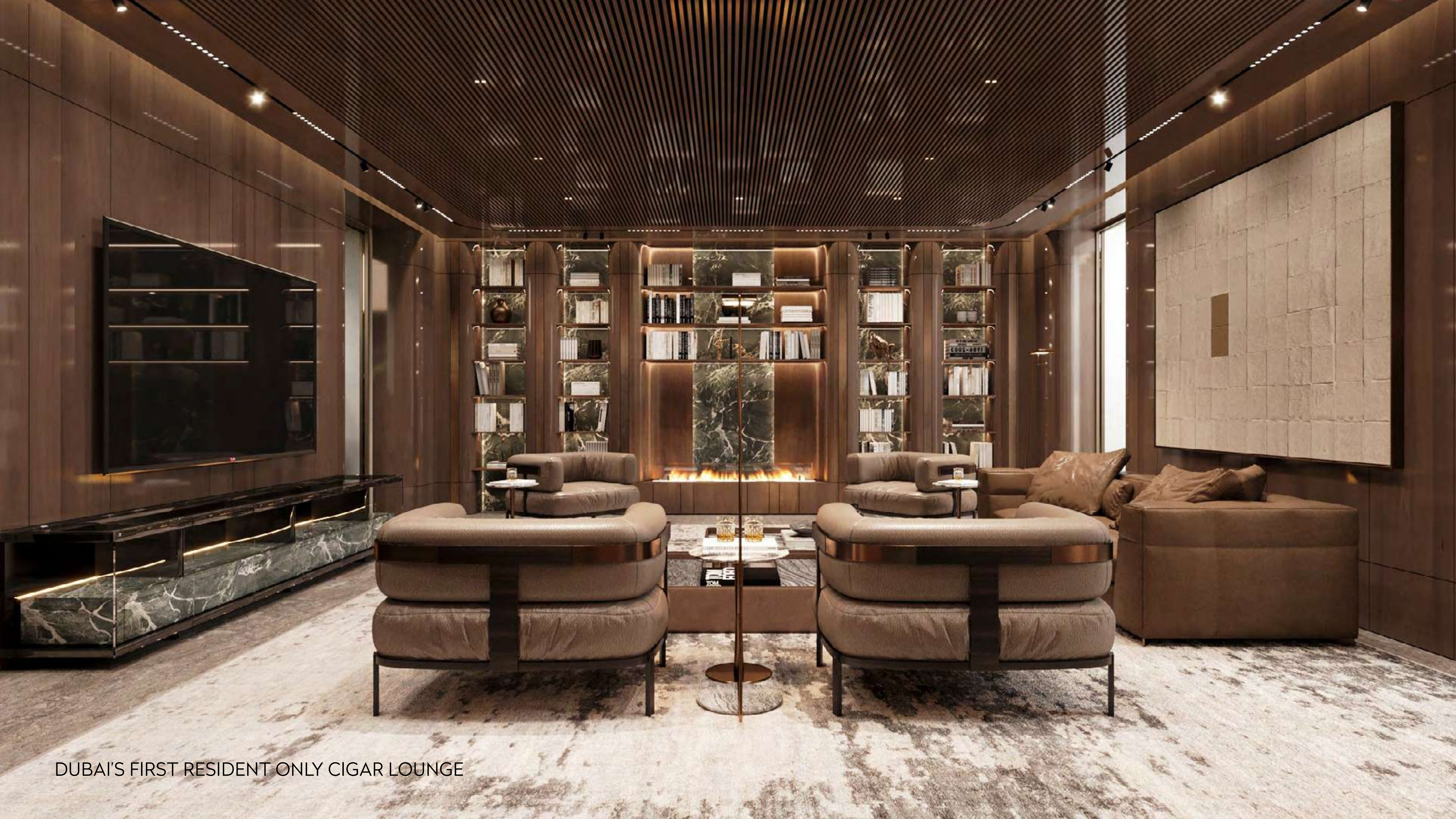
DUBAI'S FIRST RESIDENT ONLY CIGAR LOUNGE