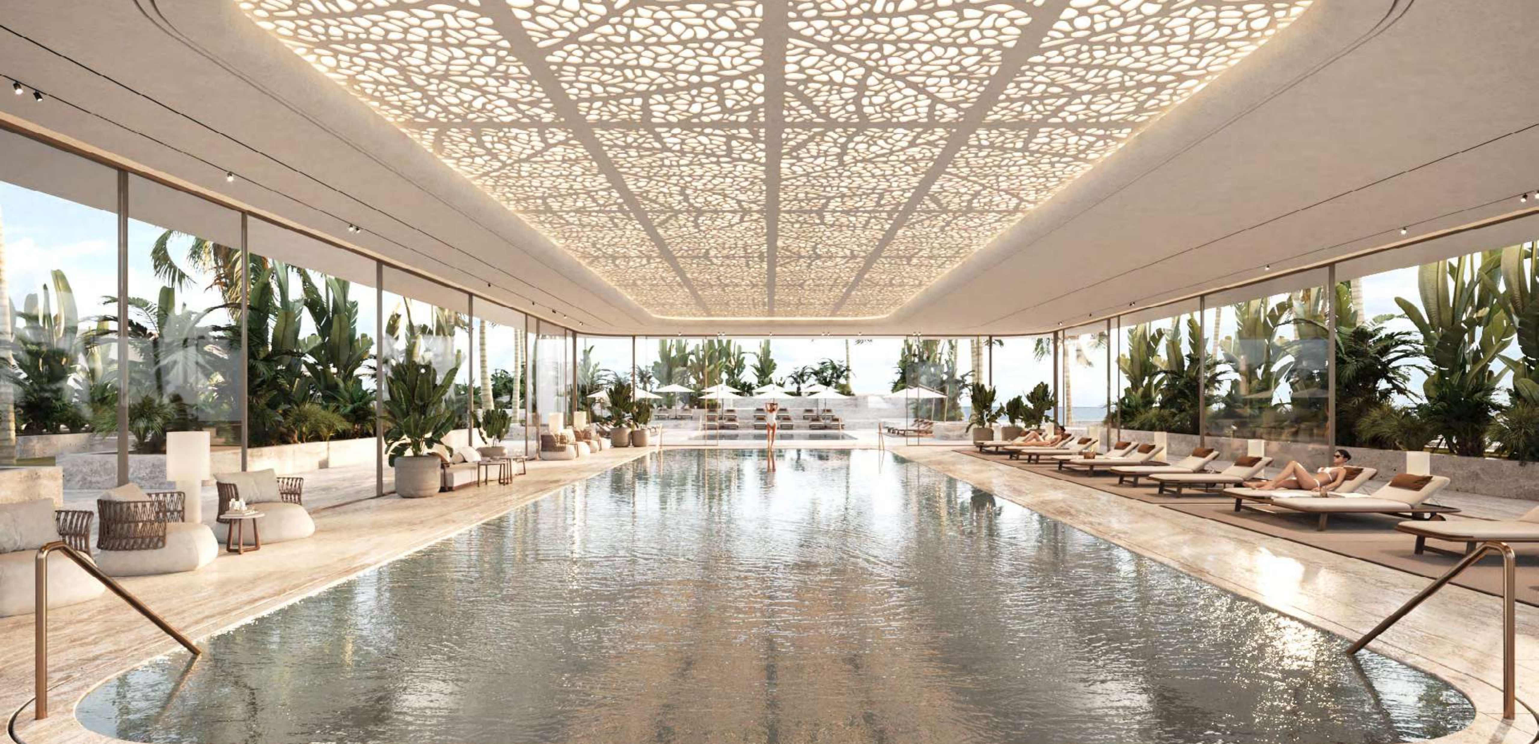
INDOOR TEMPERATURE CONTROLLED LAP POOL